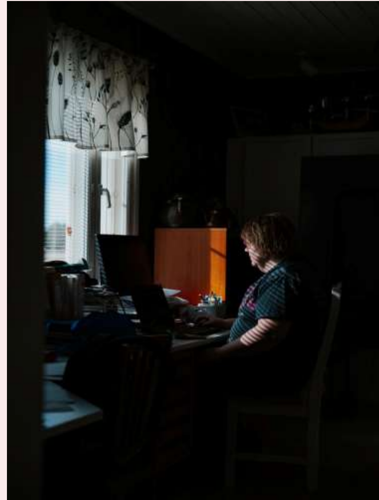
Female rural entrepreneur, Ilmajoki.