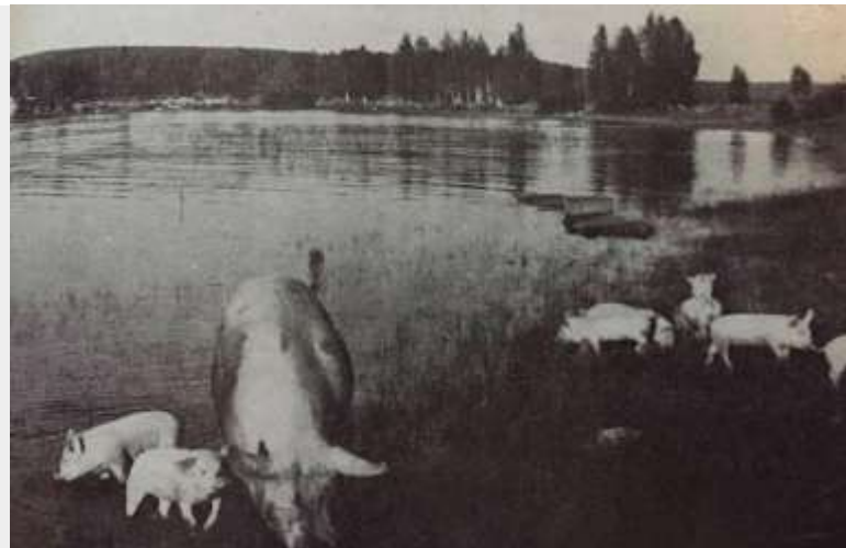
Sow and her piglets by the lake. Sika - Suomen Sianjalostusyhdistyksen tiedonantoja 165. 1962.